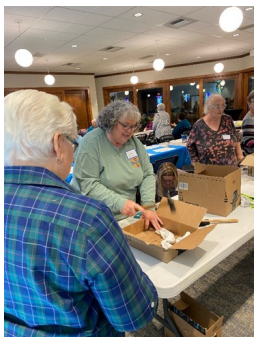
Tri River Pics